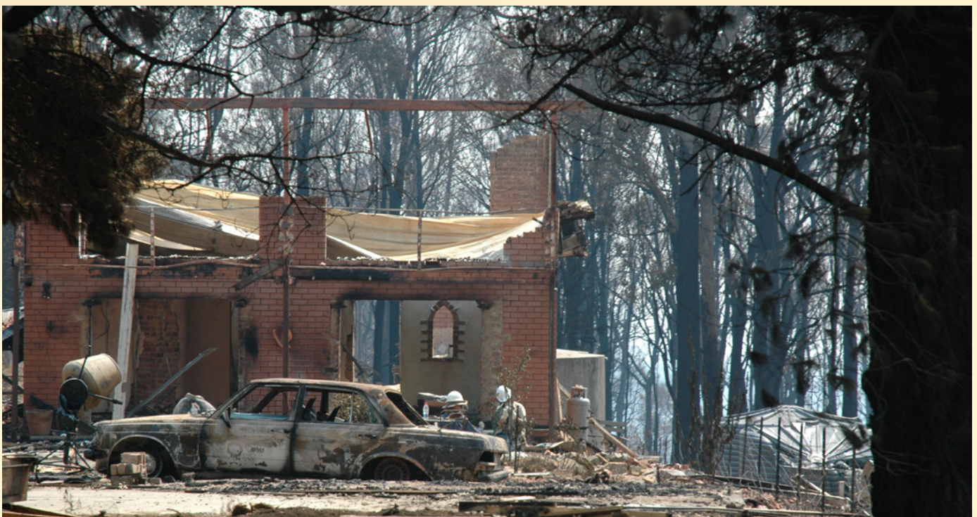
Figure 3: House destroyed from the Black Saturday bushfires in Victoria in 2009.

Having a bushfire preparation plan is extremely important. As climate change contributes to lengthened bushfire seasons and more frequent and extreme bushfire weather, these plans may need to be updated to accommodate increased risks. Relying solely upon previous fire behaviour and experience may not guarantee safety as bushfires become more intense. With lengthening fire seasons, it's also important to be prepared throughout the year.