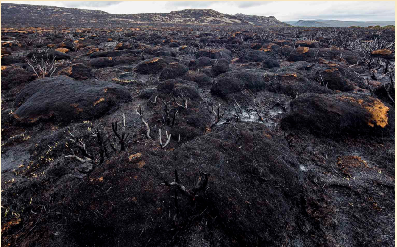
Figure 4: Burnt cushion plants and alpine vegetation, Lake Mackenzie bushfire (2016), Tasmanian Wilderness World Heritage Area.

For example, many eucalypts and wattles are fire resistant and need fire of a certain regularity and intensity to reproduce. But even “fire adapted” species can be disadvantaged or pushed to the verge of local extinction if fires are too intense, or occur too frequently for plants to mature and reproduce. Further, bushfires are now occurring in vegetation types like alpine areas and rainforests that are extremely sensitive to damage. For example, fires in January 2016 occurred in the World Heritage Area alpine vegetation of Tasmania, destroying pencil pines that were over 1,000 years old. Recovery of these areas has been slow to non-existent. The International Union for the Conservation of Nature’s Red List identifies fire as a threat to more than 100 endangered species in Australia due to direct mortality and habitat loss. Animals that survive fires may need to rely on small areas of unburnt land with reduced food supply and increased risk from predators.