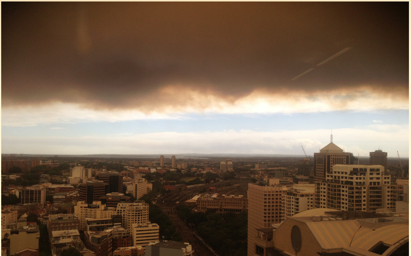
Figure 1: Thick smoke hangs over Sydney during bushfires.

Bushfire smoke can seriously affect health because it contains respiratory irritants as well as inflammatory and cancer-causing chemicals. Smoke can be transported in the atmosphere many kilometres from the fire front, affecting air quality and exposing large populations to its impacts. The estimated annual health costs of bushfire smoke in Sydney are also high, at $8.2 million per annum (2011$) (Deloitte Access Economics 2014).