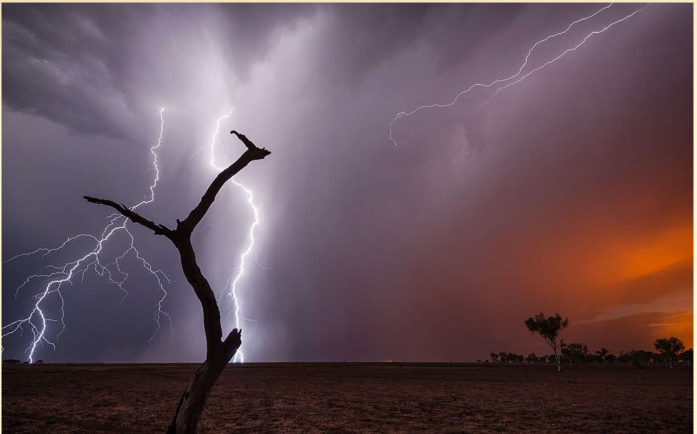
Figure 5: Lightning strikes causing bushfires in Western Australia.

Although many bushfires are accidentally or deliberately ignited by humans, lightning is another major cause. Lightning strikes are the most common natural ignition source for fires and were responsible for igniting the 2003 Canberra fires. A study published in May 2018 linked lightning-ignited fires to rising temperatures in the southern hemisphere (Mariani et al. 2018). Warmer ocean and air temperatures lead to higher evaporation rates and higher humidity, increasing the likelihood of lightning.